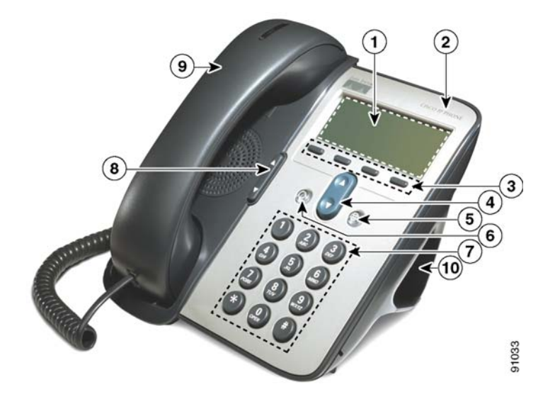
Figure 3 Cisco IP Phone 7912G Features

Refer to the following illustration and table to identify buttons and parts on your Cisco IP Phone 7912G.