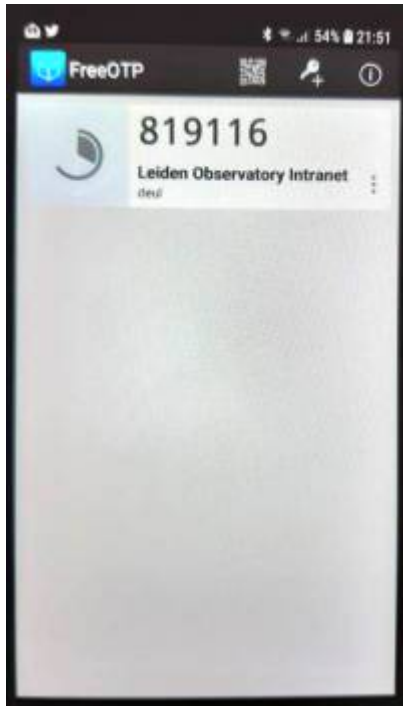
Figure 4: FreeOTP Generated passcode (Click image to enlarge).

To generate a passcode to fill into the WEB page just click the identity block on your smart phone. You are now presented a six digit number. Copy this number to the WEB page. Note that there is a little timer to the left of the passcode. This passcode is valid for the period the timer is shown. This period is 30 seconds. Within this period you must transfer the code to the WEB page and hit the Submit button. If you are too late, the next 30 seconds period start and another passcode is shown.