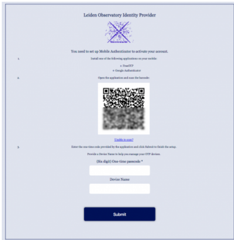
Figure 2: 2FA setup secret key form (Click image to enlarge).

After entering your account credentials you are presented a QR code on the next page. Now use your smart phone APP to scan this QR code. This QR code is in fact your personal secret key, which you are now saving to your smart phone.