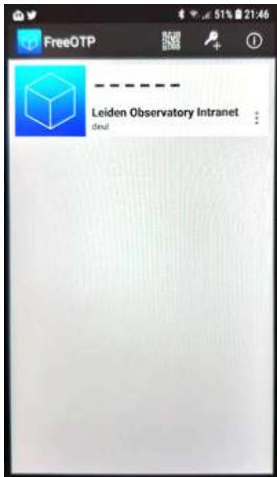
Figure 3: FreeOTP ID block after scanning QR code (Click image to enlarge).

After entering your account credentials you are presented a QR code on the next page. Now use your smart phone APP to scan this QR code. This QR code is in fact your personal secret key, which you are now saving to your smart phone.